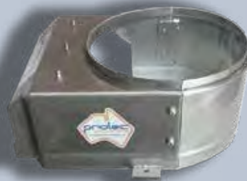
Customised Air Conditioning Duct Cowling for Mining Drill Rig