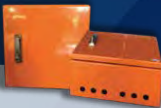
Powder Coated 400x400x200mm Custom Encl.