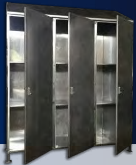
Coal Transfer Terminal Customer 2400x3000x600mm Slope Roof Three Door Cabinet, 3 point Locking, Pad-lockable Swing Handle