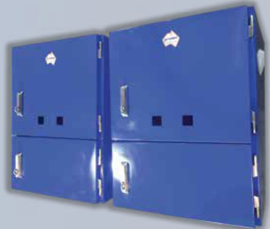
800x600x400mm Custom two door Enclosure w/ Stainless Steel Pintel Hinges, Stainless Steel Pad-lockable Swing Handles, Powder Coated 1000V Blue as per customer specs