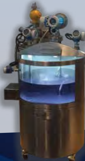
Instrumentation IMS Display Stand Equipped with Functioning Water reservoir and Automated Pump Controls