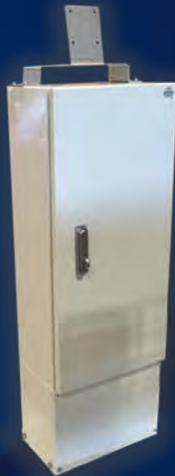
850x302x250mm Custom Enclosure w/ 300x302x250mm Plinth, Stainless Steel Swing Handle, Powder coated White, custom computer bracket mounted on top.