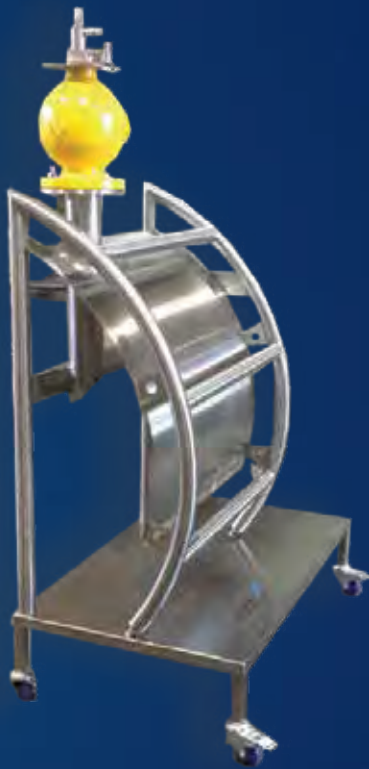
Instrumentation Density Profiling Display stand