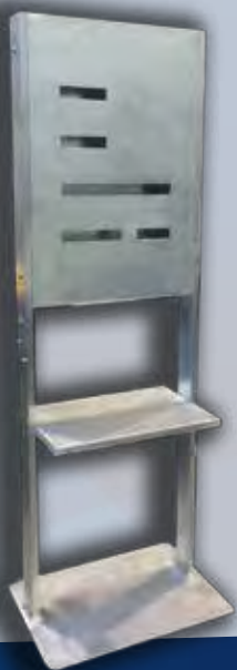
Aluminum Display Stand